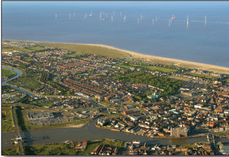
Great Yarmouth looking East