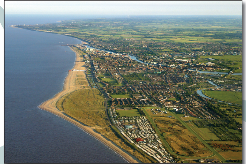
Yarmouth looking south.