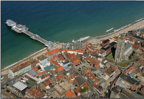
Cromer – The church tower at 160 feet is the highest in Norfolk.