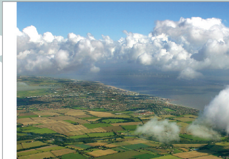
Gorleston and Great Yarmouth The highest picture shows the distinctive curve of the Norfolk coastline and the expanse of Breyton Water. The recently built Smeby Sands windfarm and the planned new Great Yarmouth harbour just to the north of the existing harbour entrance is changing the landscape yet again.