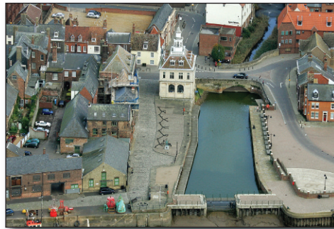
Kings Lynn Custom House