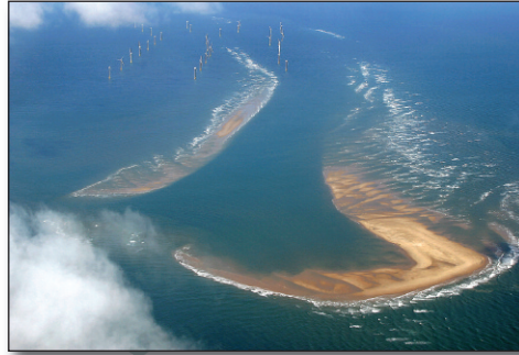
Windfarm almost complete