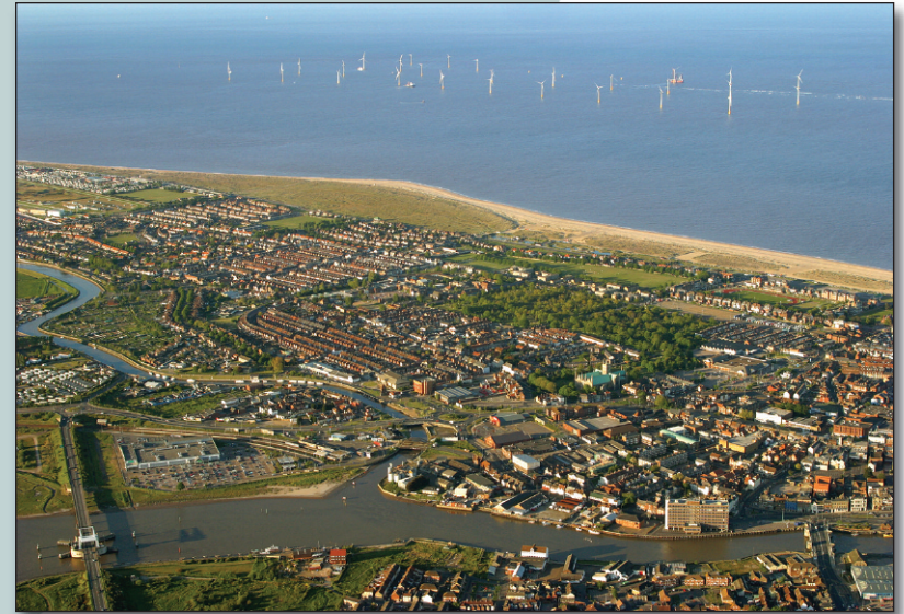
Great Yarmouth looking East